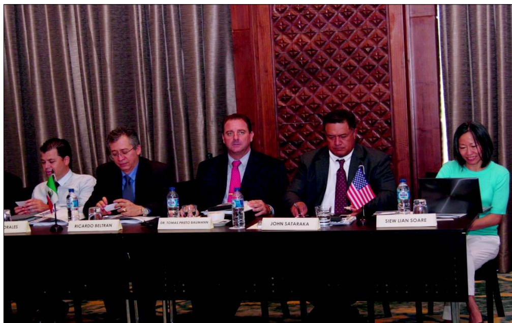
Delegates from Mexico, Spain & USA