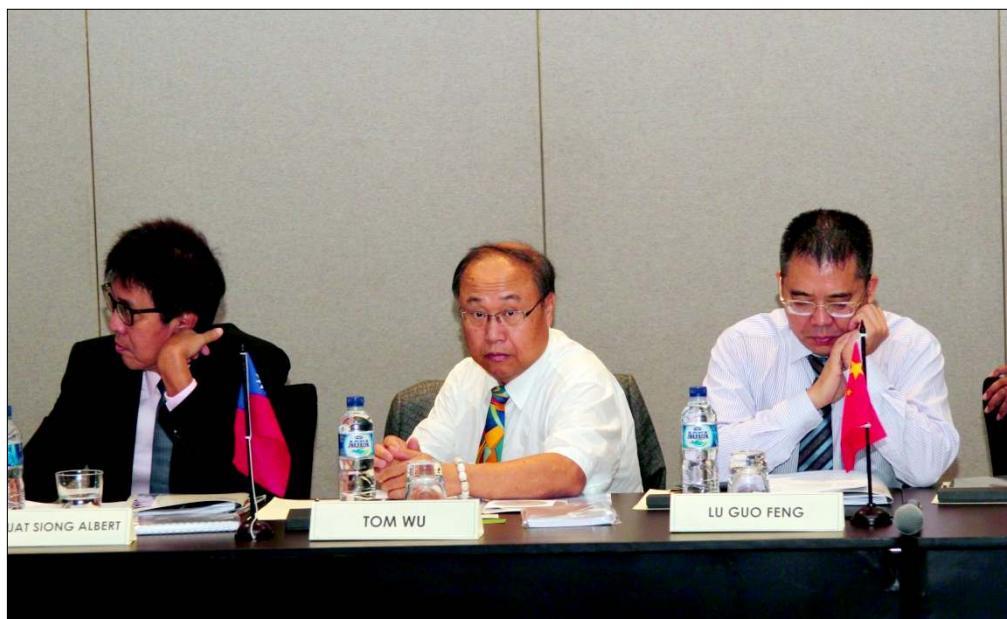
Delegates from Malaysia, Taiwan & China