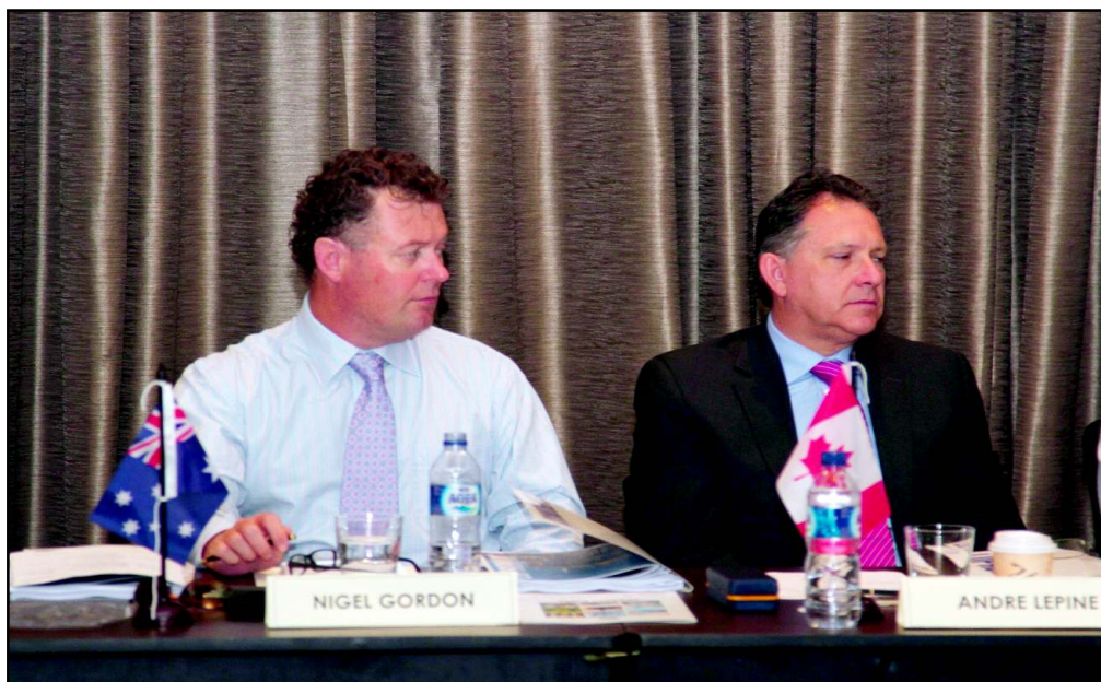
Delegates from Australia & Canada