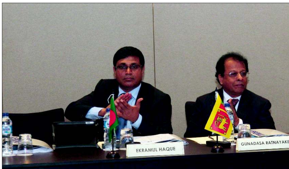
Delegates from Bangladesh & Sri Lanka