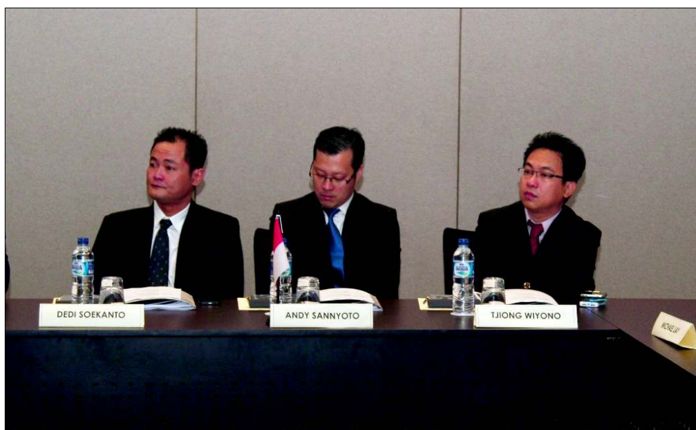
Delegates from Indonesia