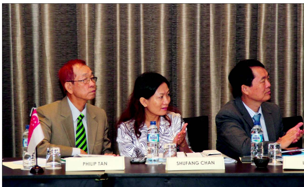
Delegates from Singapore