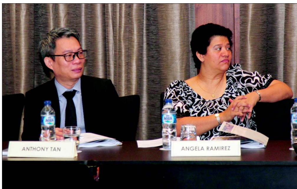
Delegates from Singapore & Columbia