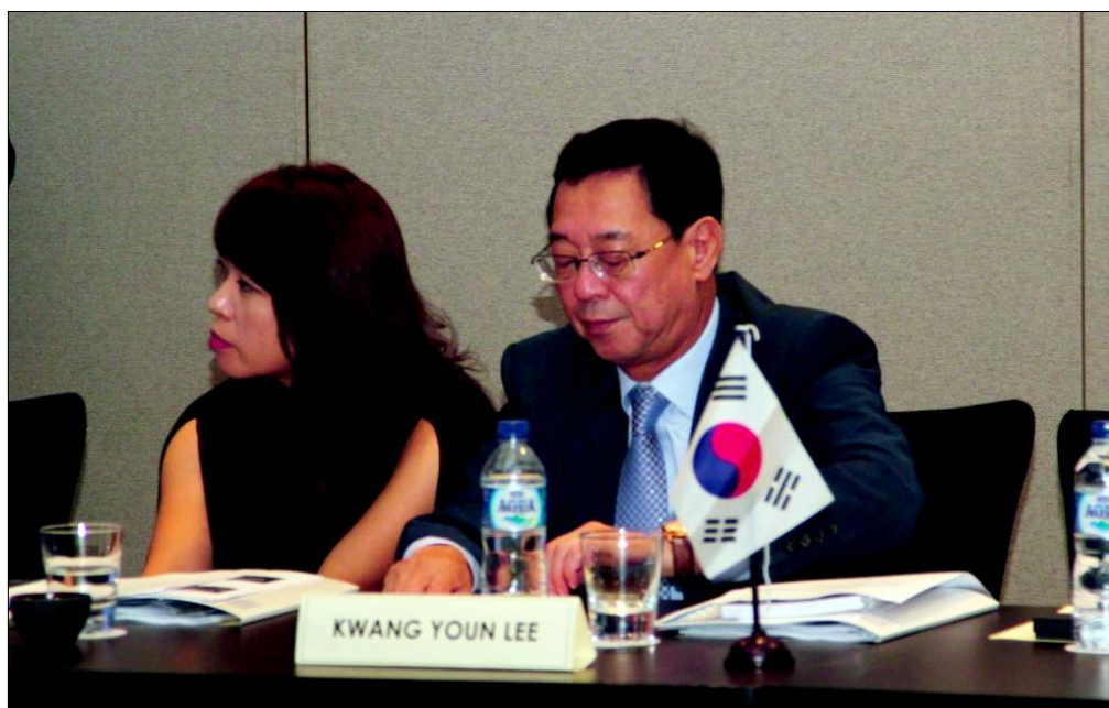
Delegates from South Korea