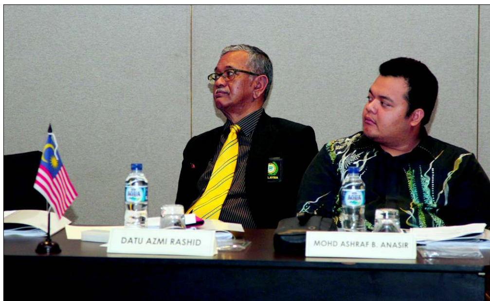
Delegates from Malaysia